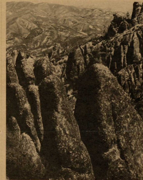
These pinnacled rocks along the High Peaks Trail are very slowly being chiseled into new shapes by the forces of weathering and erosion.

Black-tailed deer and raccoons are seen often, whereas the gray fox and bobcat, also quite common, are nocturnal and secretive. Rabbits and rodents are common and provide food for some of the larger predators. Several species of bats patrol evening skies in search of insects. The more frequently seen birds include the acorn woodpecker, brown towhee, California quail, and turkey vulture.