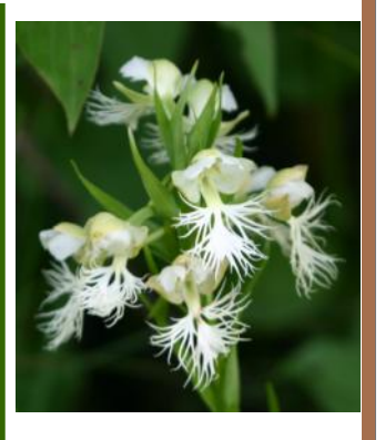
Flowering Western Prairie Fringed Orchids

sphinx moths for pollination. Unfortunately, populations of these moths also face serious challenges including habitat fragmentation and insecticide drift from aerial spraying. Survival of the WPFO requires not only protecting its habitat but also insuring the survival of the orchid's pollinators.