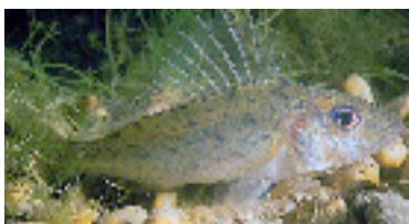
Eurasian Ruffe ( Gymnocephalus cernua )

This bait-stealing menace arrived as a stowaway aboard European trade ships. Females lay many eggs, which the males guard. These bottom dwellers easily outcompete native species, take over spawning habitat, and alter the food web.