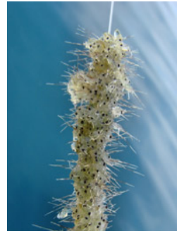
Spiny Water Flea ( Bythotrephes longimanus )

Asiatic clams and zebra and quagga mussels are fast, prolific breeders that fortunately have not yet been found here at the park. Asiatic clams can choke out native species by growing on their shells. Zebra and quagga mussels consume vast amounts of nutrients and alter water clarity. An infestation of these mollusks would have a devastating impact on park aquatic environments.