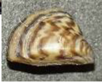
Zebra Mussel ( Dreissena polymorpha )

Asiatic clams and zebra and quagga mussels are fast, prolific breeders that fortunately have not yet been found here at the park. Asiatic clams can choke out native species by growing on their shells. Zebra and quagga mussels consume vast amounts of nutrients and alter water clarity. An infestation of these mollusks would have a devastating impact on park aquatic environments.