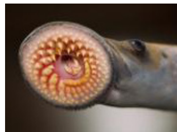
Sea Lamprey ( Petromyzon marinus )

The sea lamprey is a parasitic ocean fish that feeds only on the blood and fluids of large game fish such as lake trout. Sea lampreys migrated from the Atlantic Ocean into the Great Lakes after completion of the Welland Canal. Current management includes chemically treating park streams where sea lampreys spawn and using pheromone traps to catch adults.