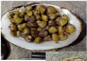
Asiatic Clams ( Corbicula fluminea )