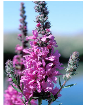
Purple Loosestrife ( Lythrum salicaria )

Purple loosestrife is an aggressive wetland invader that displaces native plants. It grows well from both rhizome and seed, and will quickly reduce an open wetland to a dense mat of blooms. A mature plant can produce up to two million seeds a year! A small patch of purple loosestrife was removed from the park ten years ago and has not returned. Help us keep this unwanted visitor OUT!