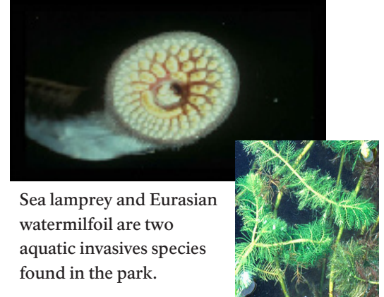
Sea lamprey and Eurasian watermilfoil are two aquatic invasive species found in the park.

Pictured Rocks National Lakeshore contains many pristine lakes and streams that are threatened by unwelcome visitors—invasive aquatic plants and animals. These non-native creatures can negatively impact wildlife habitat, upset the food chain, and out-compete native species. Both Lake Superior and several of the park's inland lakes have already been affected.