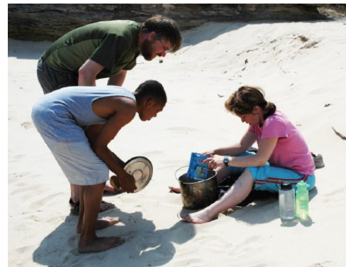
Please follow Leave No Trace camping ethics.

Backcountry toilets are available at Mosquito and Chapel Beach campgrounds. Please do not throw trash in backcountry toilets. To dispose of human waste at other locations, select a spot at least 100 feet from any trail, campsite, or water. Dig a shallow hole 3 to 6 inches deep. Bury waste and paper. Groups should establish a communal privy and cover it after the last use.