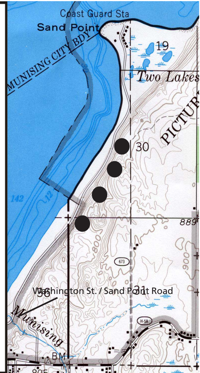
Munising ice climbing (general locations - this entire area is closed to winter camping)