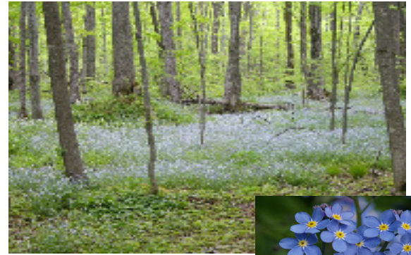
Ordinary garden Forget-Me-Nots can be aggressive forest invaders.

Pictured Rocks National Lakeshore is continually threatened by non-native, invasive plants that cause ecological damage to the park's many diverse habitats and can even harm human health. Learn to recognize some of the more common invasive plants in the national lakeshore and discover what you can do to help prevent their spread.