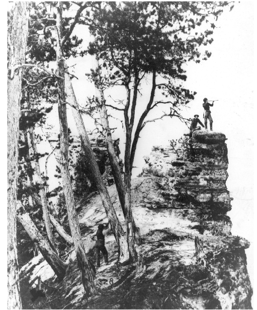
Miners Castle, circa 1870

Commercial tours have been providing boat tours past the Castle since the 1940's. This rocky cliff is a highlight of the 2.5 hour cruise that continues east to Chapel Beach.