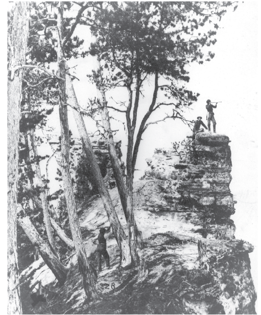
Miners Castle, circa 1870

Commercial tours have been providing boat tours past the Castle since the 1940's. This rocky cliff is a highlight of the 2.5 hour cruise that continues east to Chapel Beach.