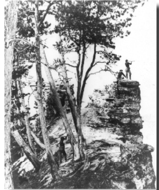
Miners Castle, circa 1870

Commercial tours have been providing boat tours past the Castle since the 1940's. This rocky cliff is one of several highlights of the 2.5 hour cruise that continues east to Chapel Beach.