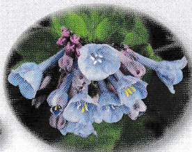
Virginia bluebells