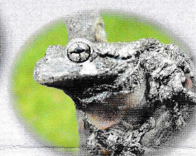
Gray tree frog NPS