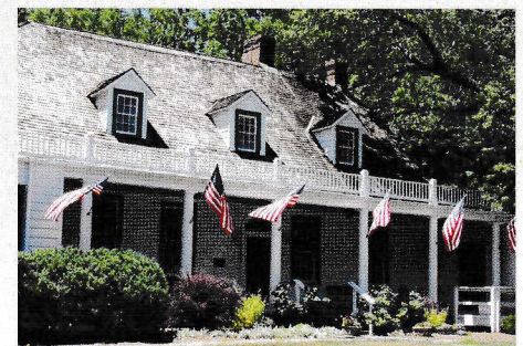
Rippon Lodge, an historic site visited by George Washington, provides a unique view of the