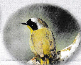
Common yellowthroat NPS