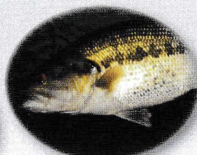
Largemouth Bass NPS