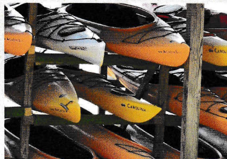
Kayaking is an increasingly popular activity.