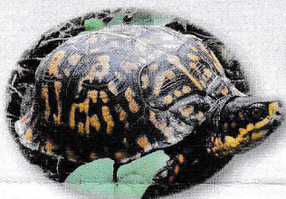
Eastern box turtle NPS

The map on the reverse depicts the existing and planned pedestrian and bicycle facilities for the Trail. Part vision and part reality, the concept of the Trail network is emerging as a tool to connect people with historic landscapes, open spaces, and recreation and education opportunities in a developing region.