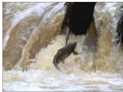
Salmon in Lagunitas Creek

Enjoy the birds that visit Rush Creek Preserve. Take a walk on the Pinheiro Fire Road to see an amazing variety of shorebirds and waterfowl that spend the winter here.