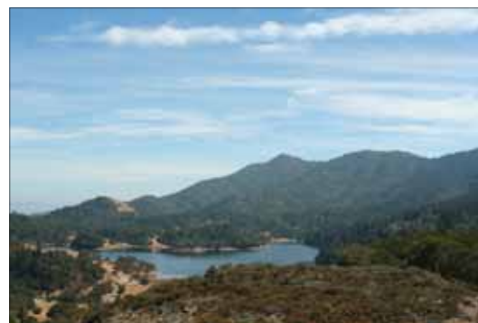
Bon Tempe Reservoir

Rodeo Beach is only a stone's throw from San Francisco and is a great spot for checking out the waves where the surf picks up in the winter.