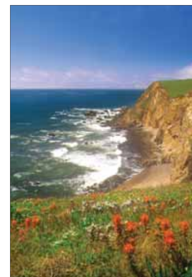
Indian paintbrush at Chimney Rock

Stay in the Marin Headlands hostel, ride the MUNI 76 bus to keep it car-free! If you do this on the first weekend of the month you can visit the NIKE site on Saturday and then hike up to Battery Townsley on Sunday!