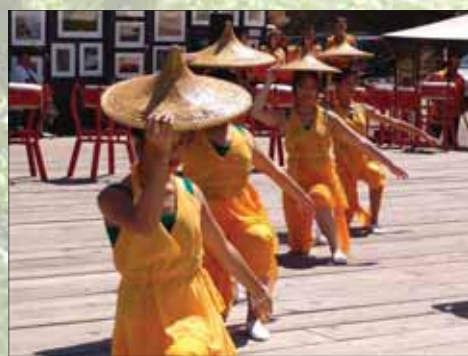
Young dancers during China Camp Heritage Day

Near the top of the Indian Tree Preserve is a dense redwood grove, catching fog and creating a cool oasis above the parched Novato landscape.