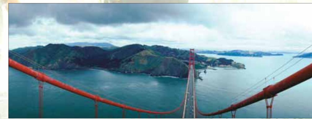
Looking north from the south tower of the Golden Gate Bridge towards the Marin Headlands

Hike the four mile Tomales Point Trail to view the native tule elk and witness a panorama of Tomales Bay, Bodega Bay and the Pacific Ocean. The trail is flat with some hills.