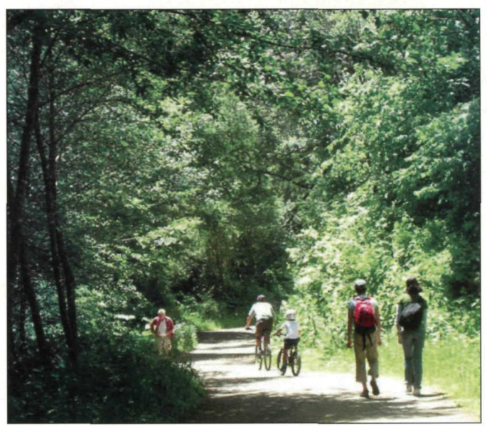
Hikers and bikers on the Bear Valley Trail at Point Reyes National Seashore.