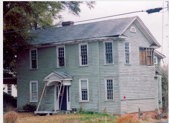
This sample application was developed for the house pictured above.

Complete these boxes until all aspects of your project are fully described. Be sure to include details like proposed finishes (drywall, plaster, etc.) and planned methods of repair. Even items that do not qualify for the credit like new additions and landscaping should be included.