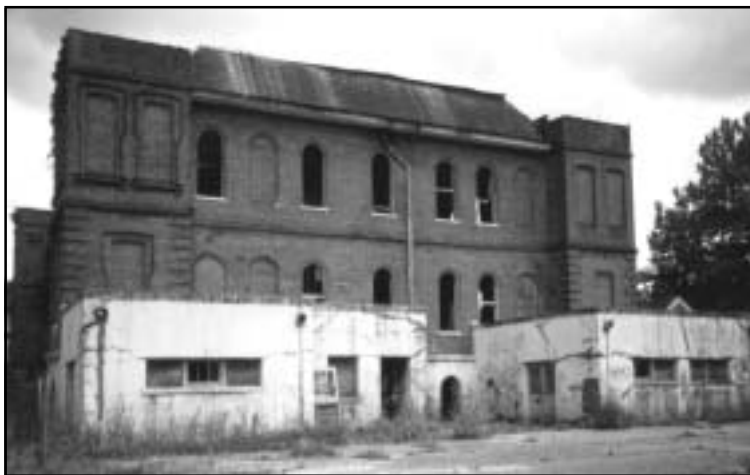
The rear elevation of the school building before the removal of the two later, non-significant additions.