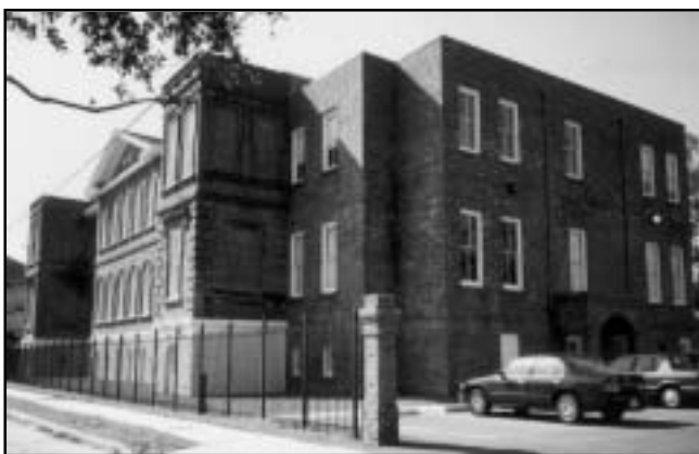
The simple design of the new addition at the rear of the building is completely compatible with the historic character.