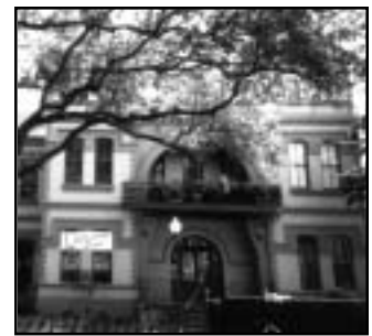
The main front entrance of the orphanage after its conversion to residential apartments.

used for offices. This building, L-shaped in plan, extends along a major street for most of a city block, and it is anchored by a three-story double-towered entrance at one end and a smaller simpler tower at the other end. The developer determined that more room was needed to ensure the financial success of the conversion of this building into residential apartments. Accordingly, a new two-story addition was planned at the rear and side of the former orphanage. Constructed of brick, and painted to help blend with the historic building that is also painted, the addition is simply designed, and features flat-arched windows with two-over-two sash that contrast with the rounded arches of the historic windows. This new addition meets the Standards. It is clearly differentiated from the historic building, and it is compatible in materials, design, size, and scale. A row of townhouses in front of the new addition further minimizes its visibility from the street.