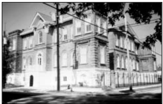
The school, which is prominently situated on a corner, is shown after rehabilitation. The new addition at the back (right) cannot be seen from the corner.