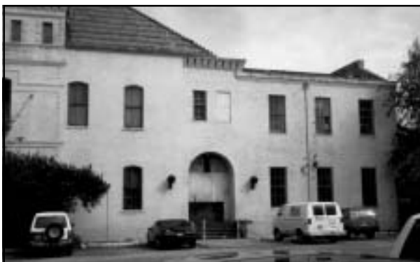
The side wing that extends behind the main entrance to the building prior to rehabilitation, and construction of the new addition.