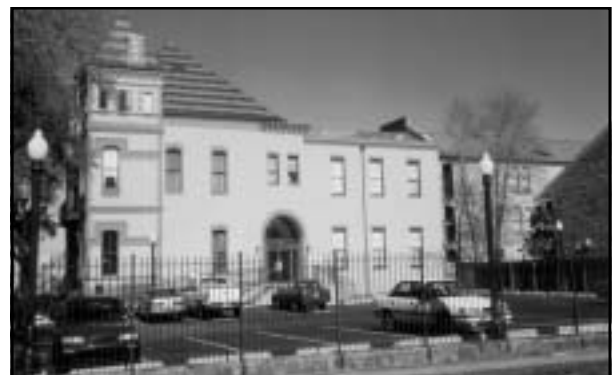
The new addition at the rear of the side wing is unobtrusive, and compatible with the building's historic character. Townhouses (on the right) in front of the addition further limit its visibility.