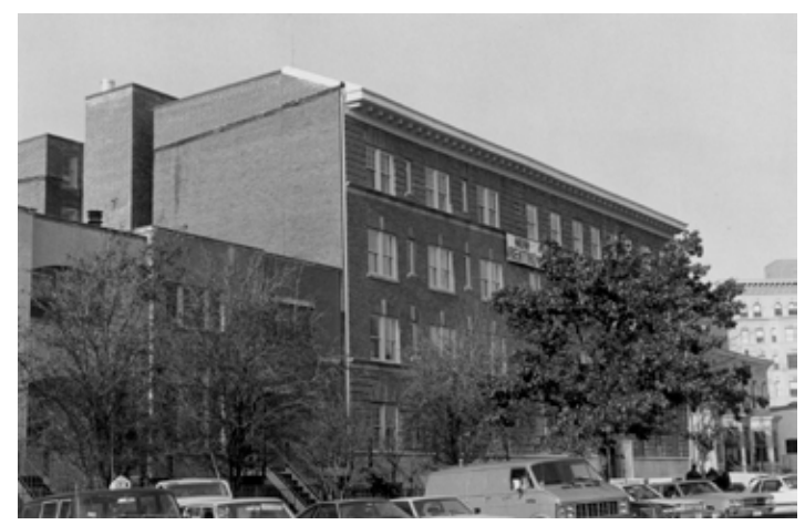
New rooftop addition and stairtower visible on the south elevation.