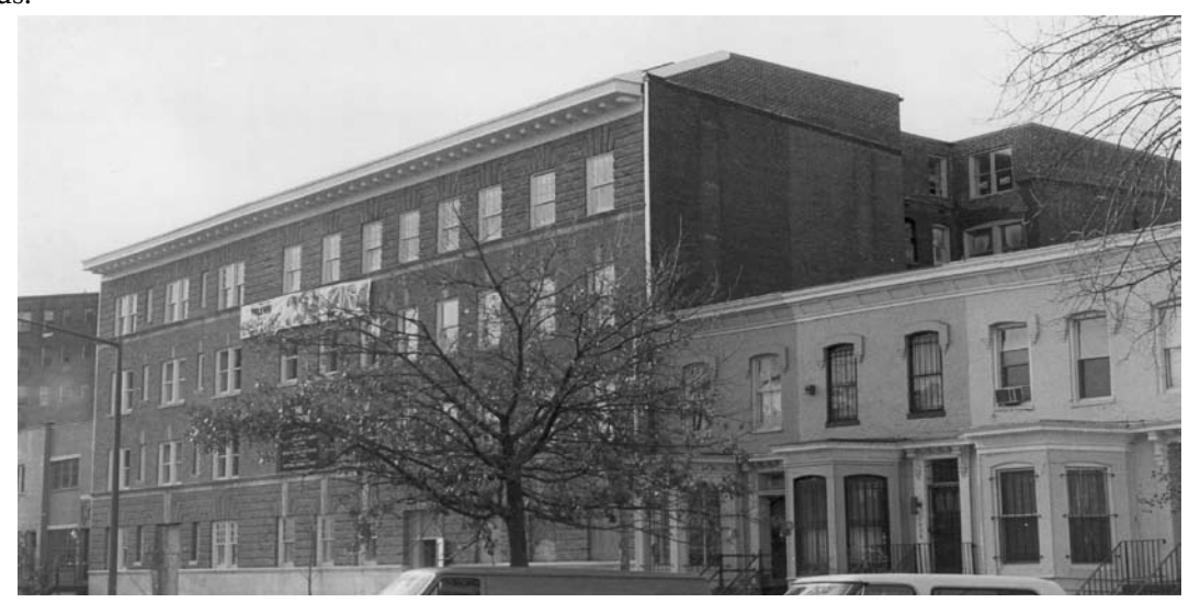
New rooftop addition and stairtower visible on the secondary north elevation, meets the Standards, and is compatible with the historic building.