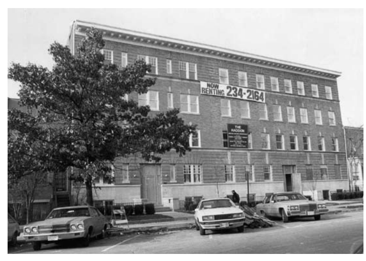
This early twentieth century apartment building was actually constructed as two buildings of harmonious but slightly different design.

However, a new floor was added that is only minimally visible on the non-significant side elevations and is imperceptible from directly across the street. Setting the new floor into the flat roof plane lowered the profile of the addition to the height of a half story. The slanted front edge further minimized the appearance of the addition and concealed integral skylights. The mass blended with the solid, unadorned side walls of the historic building. This rooftop addition does not impact the historic character of the building and is in conformance with the Standards.