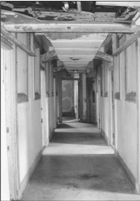
Above: The dropped ceiling has been partially removed, revealing the old ductwork running through the center of the hallway and branching into each office. The ceiling had been lowered from its historic height of 10 feet to just 7 feet.

Applicable Standards: 2. Retention of Historic Character 5. Preservation of Distinctive Features, Finishes, and Craftsmanship 6. Repair/Replacement of Missing or Deteriorated Features