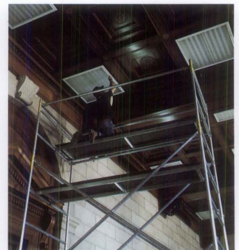
3. The light fixtures were carefully removed to permit installation of a sprinkler system behind the coffered ceiling and to restore the ceiling to its original appearance. It was necessary to reproduce 40 new panels for installation in the coffered ceiling, due to the damage resulting from the 1962 lighting work.