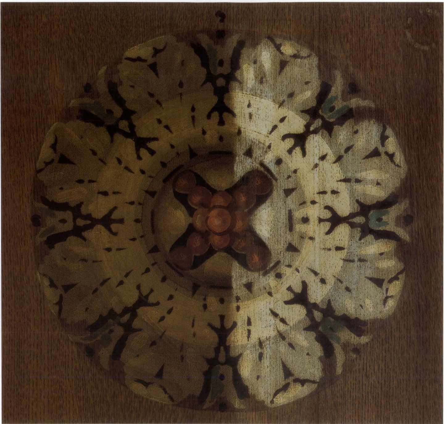
4. A historic stencilled panel was removed and cleaned in order to have a model for the replacement panels. In this view, only half of the panel has been cleaned, revealing the difference between the aged and original appearance of the ceiling. Since the ceiling was not scheduled to be cleaned, a decision was made to reproduce the original panel appearance and then artificially age the replacement panels to blend in with the existing ceiling.

the medallion contain free-floating decorations, the paper backing would have to be carefully trimmed and the decorative elements separately applied in order for the natural wood background to be visible. This was a possible alternative, but would require careful handwork in the workshop.