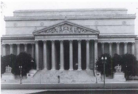
1. Completed in 1935, the National Archives is the repository for official Federal documents.

Besides hand-stencilling, consideration was given to having lithograph prints made of the entire cleaned panel, wood graining included, and gluing them onto new plywood panels. The completed panel would then have received a protective varnish coat. Since the background wood panel would be printed along with the stencilled medallion, several original panels would need to be removed to use as models in order to keep the replacements from standing out due to a uniform appearance. This approach was rejected because of the difficulty of removing undamaged panels from the ceiling. A modified stencil was also considered; in this approach the stencilled medallions alone would be cut out and applied to oak veneered plywood panels. As the outer edges of