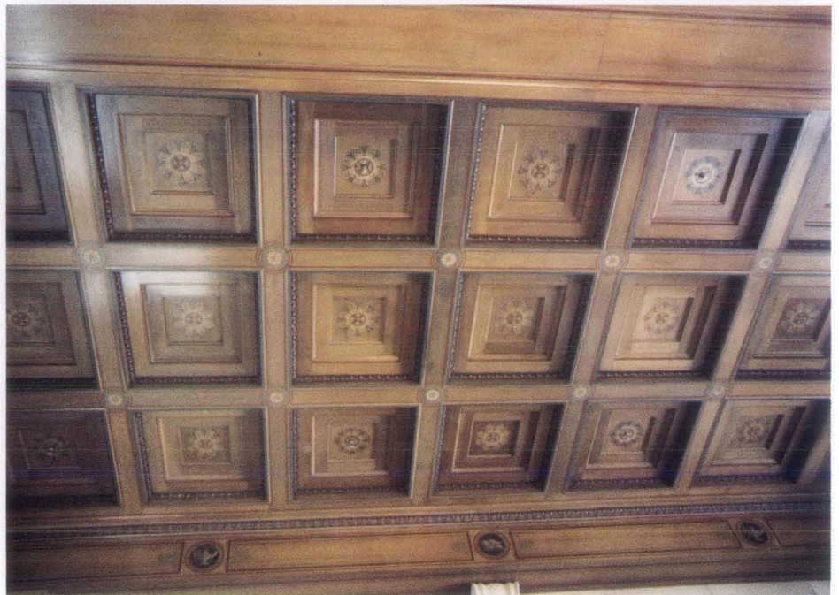
7. Following the work, the difference between the decal replacements and the historic stencilled panels is not discernible from the floor of the Central Search Room.

jobs involving larger quantities of mass-produced decals, the unit cost would be substantially reduced.