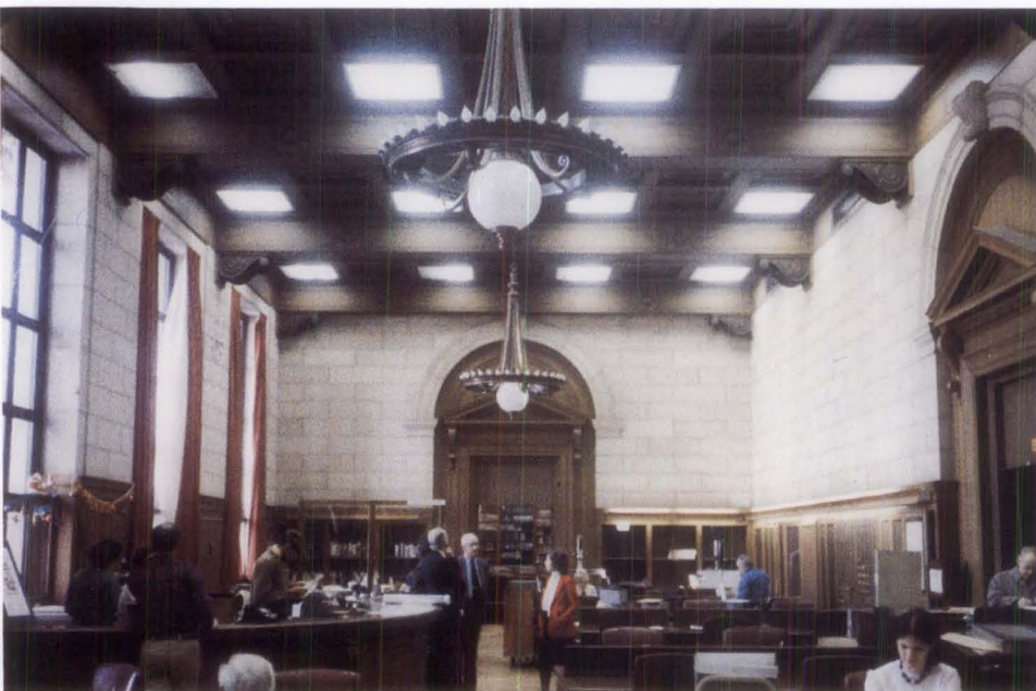
2. The 40 large visually obtrusive fluorescent lights, installed in 1962, damaged the coffered ceiling in the Central Search Room.