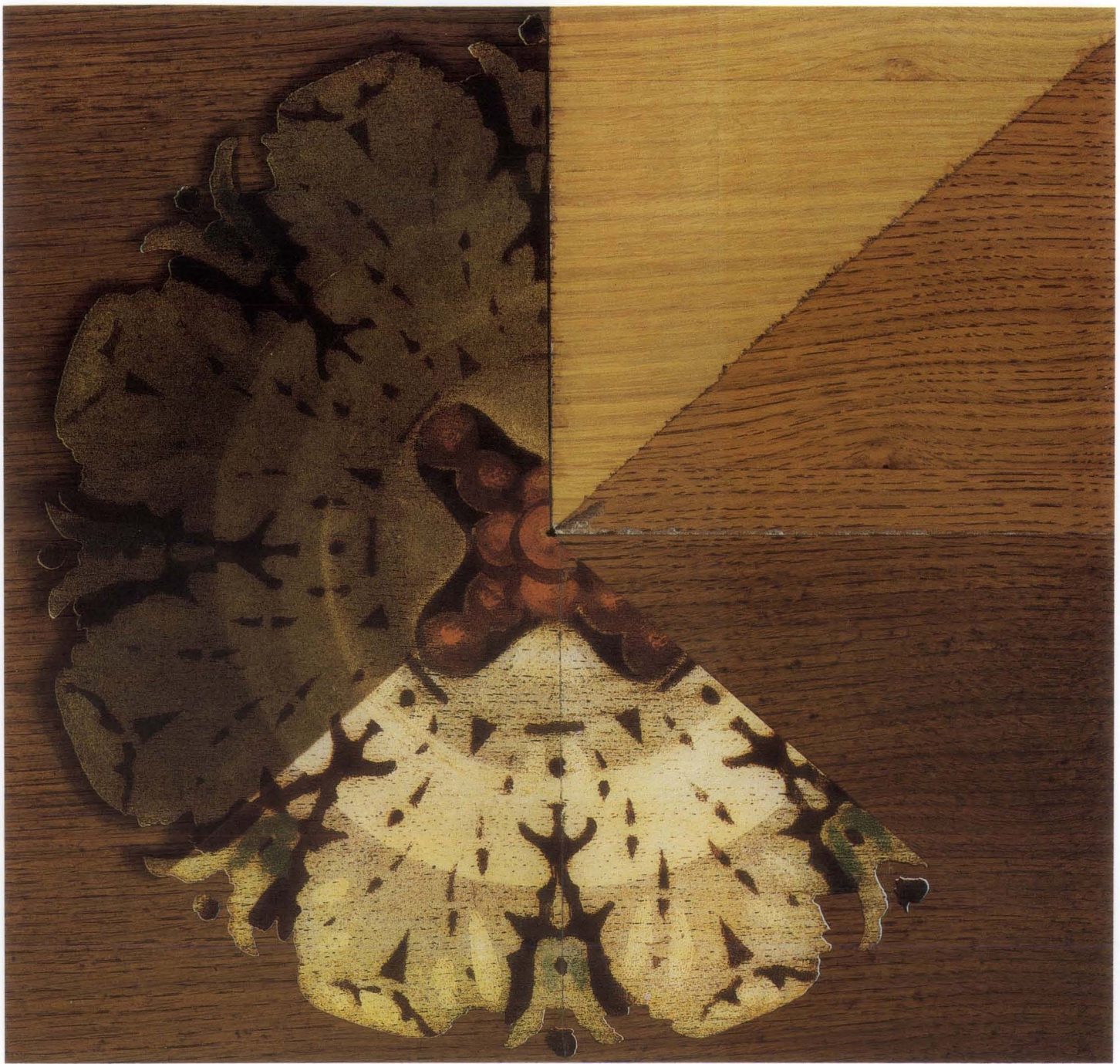
5. This demonstration model shows the various stages involved in finishing the ceiling panel. Starting with the raw wood panel in the upper right corner (1) and moving clockwise, a penetrating stain was applied (2) that matched the historic stain. A tinted varnish, or sealer, (3) was then applied to ready the backing panel to receive the decal (4). Two coats of acrylic sealer were used to protect this "cleaned" condition. The next 3 steps (5, 6, 7) produced the "aged" appearance with tinted varnish layers sprayed on using cardboard masks to produce the proper tones. A top coat of clear varnish (8) provided the final protective layer.

darkening within the grain, without obscuring the wood itself. A non-yellowing, light-stable oil varnish was used to seal the panel and to receive the medallion decal.