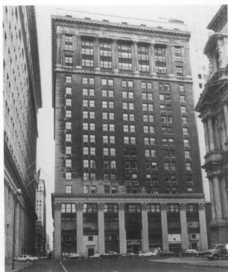
Figure 1. In 1989, just prior to the onset of the rehabilitation project, the Widener Building was showing the effects of 75 years of exposure to an urban environment. Note the lighter color of the left side of the building regularly washed by rain.

The rehabilitation of historic buildings often includes the cleaning of the masonry. Removal of the deleterious deposits of particulate matter from the stone's surface generally enhances the appearance of an historic building and in the case of calcareous stones, furthers the long-term preservation of the masonry by eliminating whatever is damaging the fabric. Since the Widener Building had been subjected