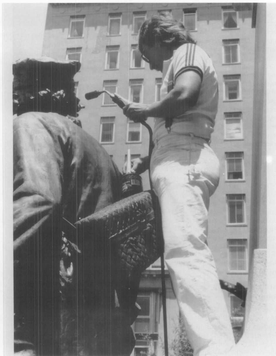
Figure 5. Heating the surface of the west sculpture group in preparation for the application of wax.