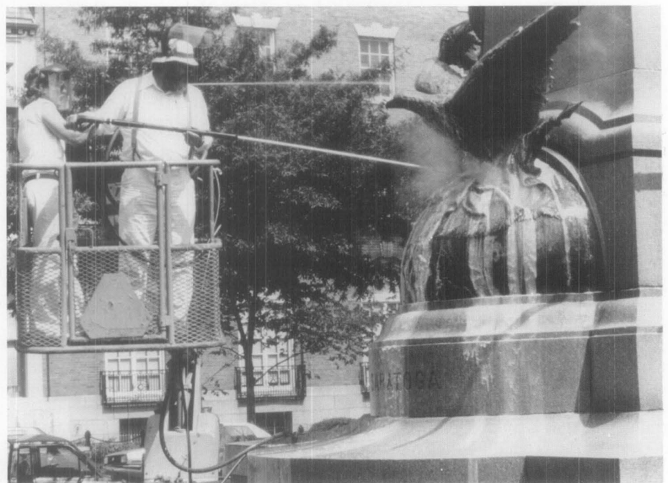
Figure 1. North sculpture group being pressure washed with detergent and water.

Cleaning began with a pressure washing using hot water (250 degrees Fahrenheit) and a non-ionic detergent at three gallon per minute (gpm) and 300–500 pounds per square inch gauged (psig) (see figure 1). This initial cleaning removed considerable amounts of encrusted bird droppings, twigs and leaves lodged behind sculptural groups, mud daubers' nests, and surface dirt and grime. Once the bronze had dried, cleaning continued with the ground walnut shell blasting, using a pressurized pot sandblaster, a