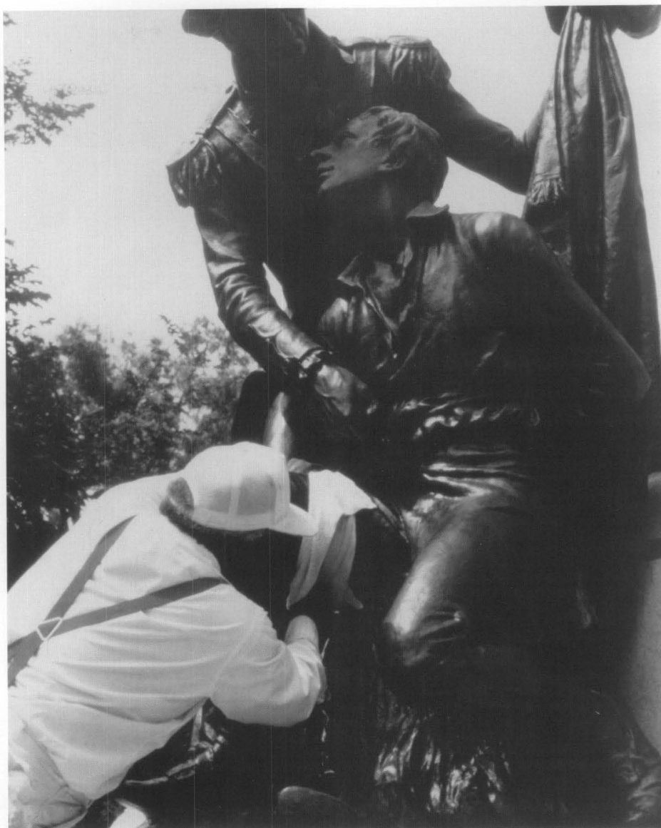
Figure 7. East sculpture groups being buffed after it had received its final wax coating.

The second waxing served two purposes. Primarily, it provided a thicker and more durable protective layer. In addition, it enabled the technicians to detect and fill any areas they may have missed during the initial waxing. After completing the second wax coating, the statues were allowed to cool, expedited by being sprayed with water from a garden hose. Once they were cool and dry, a final paste wax coating was thinly applied without using heat. Soft brushes and damp terrycloth rags were used to apply the paste in much the same manner one would use to wax an automobile. Allowed to cool overnight, the final wax coat was lightly buffed to a gloss with barely damp terrycloth towels (see figure 7). Like the additional coating of BTA discussed earlier, the final application of a cold wax concentrated on the more highly exposed areas that were subject to greatest atmospheric degradation. The final waxing also helped to remove any brushstrokes that may have remained from the two hot waxings (see figure 8).