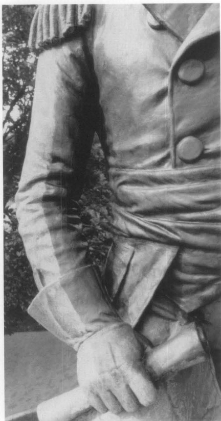
Figure 6. Detail of the Kosciuszko portrait. The chest and inside section of the arm has received its first coating of wax. The outside section of the arm has not.

heat that would have burned previously applied coats of wax.