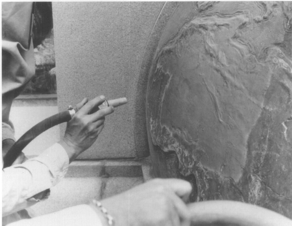
Figure 2. South sculpture group being cleaned with walnut shell blasting.

After the sculptural groups had dried, they were treated with a two percent solution of the corrosion inhibitor Benzotriazole (BTA) suspended in a 4:1 mixture of hot water and ethanol (see figure 4). The solution was applied using a pump sprayer of the type used by insect exterminators. The