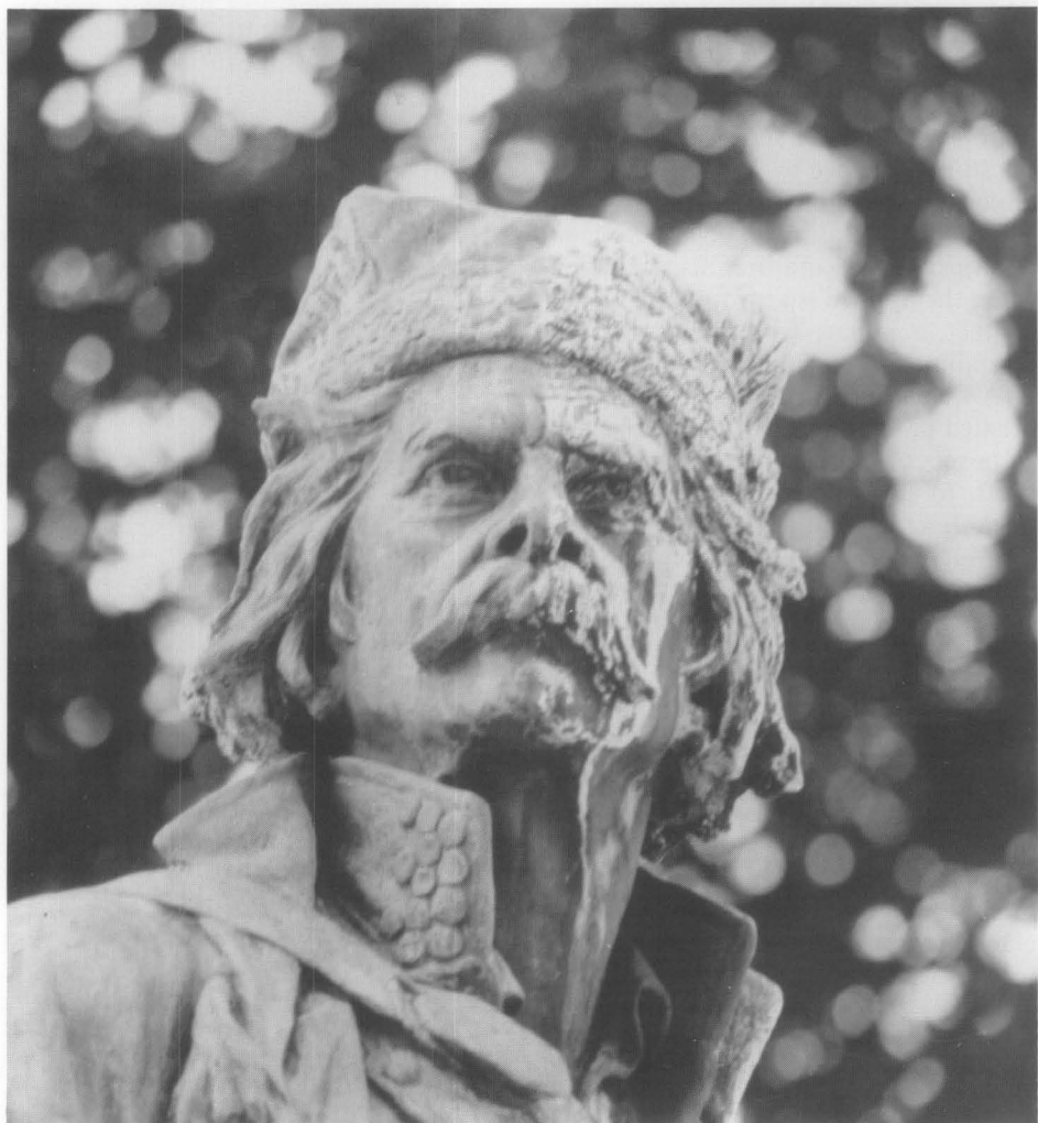
Figure 3. Detail of the west sculpture group, depicting a pair of soldiers. Left half of the face has been blasted and presents a more even appearance than the right half, which has not been blasted and exhibits the light/dark streaking common to corroded statuary.