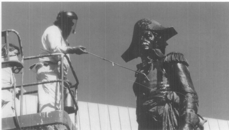
Figure 4. Solution of Benzotriazole (BTA) being sprayed onto the Kosciuszko portrait atop the monument after cleaning with walnut shells.

Once the metal had reached the appropriate temperature, discernible when the applied wax would melt on contact, a prepared mixture of microcrystalline waxes, mineral spirits and BTA was applied sparingly with short bristled natural brushes (See Project Data section for components of the wax). To apply the wax, a scrubbing or jabbing motion was used to insure thorough coverage in corrosion-produced pits and irregularities in the surface that had resulted during casting. Once the bronze had received a coating of wax, it assumed a much darker green-brown color, a semi-glossy surface, and an overall uniformity of appearance far beyond that produced by the earlier walnut shell blasting (see figure 6). A second coating of wax was applied using the same method described above. The technicians found that less heat from the torches was needed during the second waxing. Because the sculptural groups had darkened with the first application, they attracted more solar radiation and therefore reached the necessary working temperature more rapidly. In addition, the technicians were careful not to apply excessive