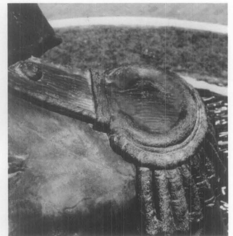
Figure 9. Detail of Kosciuszko's right epaulet [photo taken in June, 1988] showing degradation of the wax coating that occurred during the year following its initial cleaning and waxing.

With the measures taken to clean and wax the bronze statuary of the Kosciuszko Monument, the statues regained the uniform color and the metallic sheen they had possessed before being subjected to years of neglect and the vicissitudes of a hostile environment ( see figure 10 ). Moreover, with regular low-cost maintenance, these statues can be protected from further environmental degradation. Unlike other cleaning methods that remove all existing corrosion, those described here represent minimal intervention and, in accord with accepted conservation standards, are reversible.