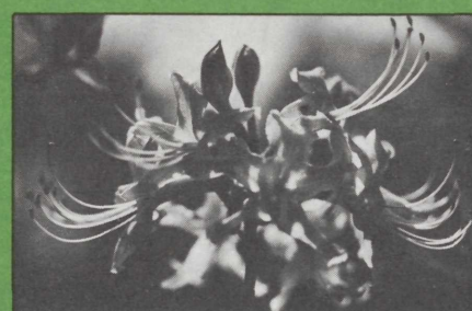
The delicate flowers of the azalea are among the showiest of the park's wild shrubs.

National Park Service U.S. DEPARTMENT OF THE INTERIOR