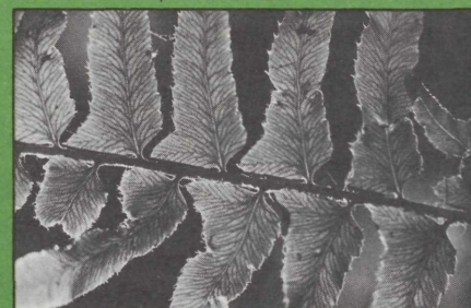
Christmas fern remains green for the holidays and throughout the winter.