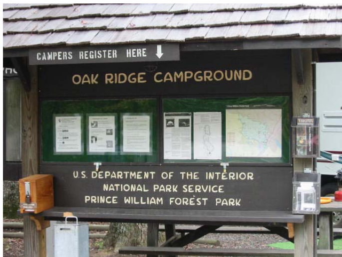
The self-registration station at Oak Ridge Campground.

Park Website www.nps.gov/prwi Updated regularly.