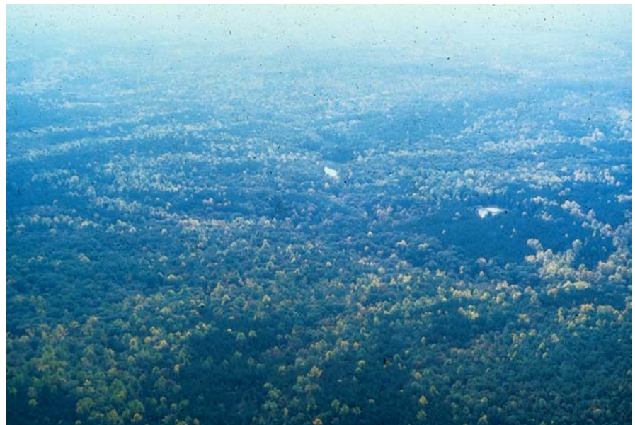
An aerial view of Prince William Forest Park, which is the largest natural area in the Washington, D.C., metropolitan region at over 15,000 acres.

Prince William Forest Park is proud of being a leader in creating an area that is environmentally conscientious. Visitors can find examples of recycled products throughout the park, including; recycled paper and paper products, recycled plastic lumber benches, picnic tables and boardwalks, and