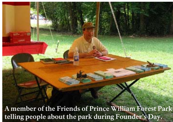
A member of the Friends of Prince William Forest Park telling people about the park during Founder's Day.