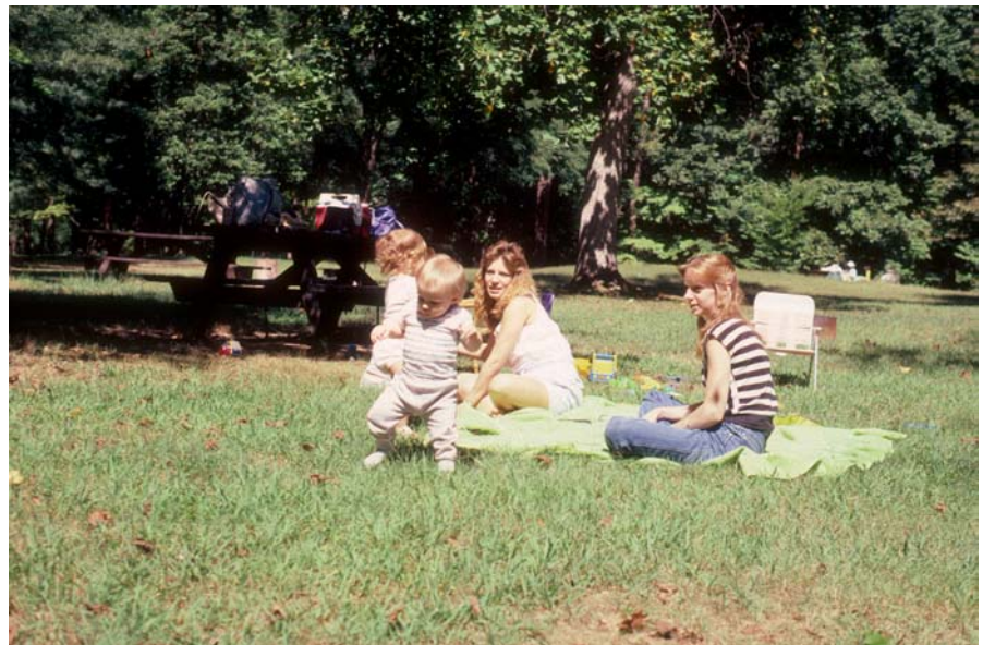
Just a little bit of planning can go a long way in keeping you and your family safe this season.

Following these simple safety tips will help you to enjoy this season and many more to come in the park!