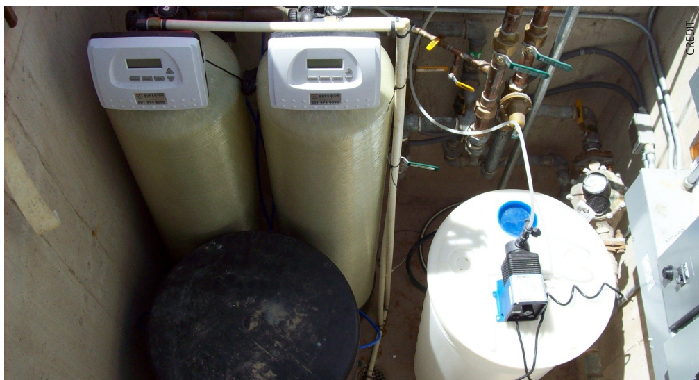
Water systems can require several hours of preparation before they are ready for the season.