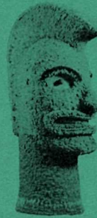
Kū-kā'ili-moku, war god of Kamehameha.