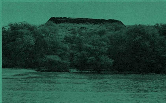
The great platform of Pu'ukoholā Heiau as seen from the shore of Kawaihae Bay.

Kamehameha built this temple because a prophet had told him that if he did so, he could fulfill his goal of conquering the Hawaiian Islands. The temple was completed in 1791, and Kamehameha dedicated it to his war god Kū-kā'ili-moku with a sacrifice of the body of his principal rival on Hawaii. The island soon fell to him, and about 4 years later the Hawaiian Kingdom was founded—and Kamehameha was ruler of all.