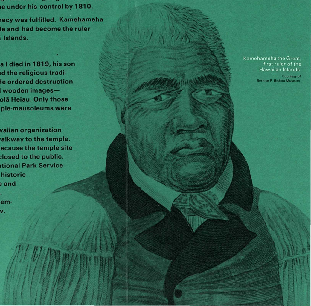
Kamehameha the Great, first ruler of the Hawaiian Islands.

About 1928, a Hawaiian organization built steps and a walkway to the temple. Today, however, because the temple site is crumbling, it is closed to the public. The goal of the National Park Service is to preserve the historic religious structure and to protect visitors. You can view the temple site from below.