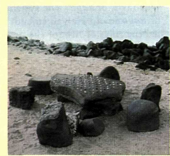
As you make your way through the park, take time to look around. Stop by a tide pool—maybe you'll see live coral (above) or other living creatures. Or try your hand at a game of kōnane (left). Rules for this old Hawaiian checker game are at the visitor center. And be sure to notice the different kinds of plants and trees here, such as the milo (right).