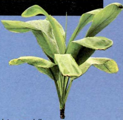
Left to right: noni (Indian mulberry) leaves and fruit; kōnane players; the royal grounds; aerial view of the pu'uhonua ; two ki'i , guardians of the place of refuge; ti plant. Background photo: Hale o Keawe with Keone'ele cove in foreground.

kapu was broken the penalty was always death. Otherwise the gods might react violently, perhaps with volcanic eruptions, tidal waves, famine, or earthquakes. To protect themselves from catastrophes, the people pursued the kapu breaker until he was caught and put to death—or until he made his way to a pu'uhonua . If he did reach a pu'uhonua , a ceremony of absolution was performed by the kahuna pule (priest). The offender could then return home safely, usually within a few hours or by the next day. The spirit of the pu'uhonua was respected by all.