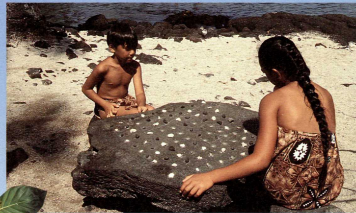
National Park Service

On the black lava flats of the southern Kona Coast, Pu'uhonua o Hōnaunau preserves aspects of traditional Hawaiian life. Hōnaunau Bay, with its sheltered canoe landing and availability of drinking water, was a natural place for the ali'i —royal chiefs—to establish one of their most important residences. Separated from the royal grounds by a massive wall was the pu'uhonua , a place of refuge for defeated warriors, noncombatants in time of war, and those who violated the kapu , the sacred laws. This place was used for several centuries. Then, in 1819, Kamehameha II abolished traditional religious practices and many of the old religious sites and structures were destroyed or abandoned. The temples of the pu'uhonua were left to the extremes of sun, wind, and sea. The area was set aside as a county park in the 1920s. In 1961 it became a national historical park to maintain a setting where many of the old Hawaiian ways carry on in the modern world.