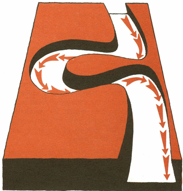
THE CUTTING OF A NATURAL BRIDGE.

How Was It Formed? Many millions of years ago sluggish streams flowed to the south and west across