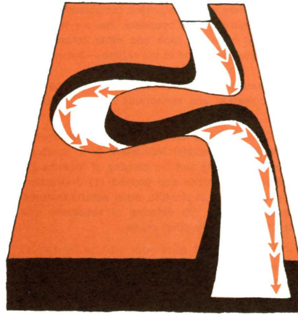
THE CUTTING OF A NATURAL BRIDGE.

How Was It Formed? Many millions of years ago sluggish streams flowed to the south and west across