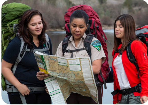
Backpackers getting oriented before their hike