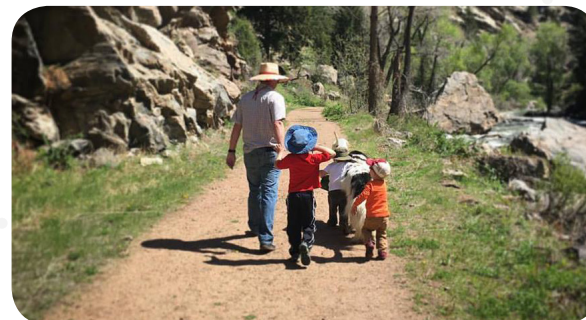
Family exploring a trail