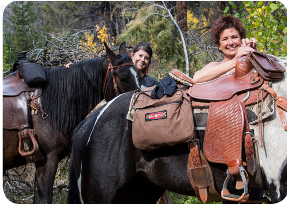
Enjoying a guided horseback riding opportunity