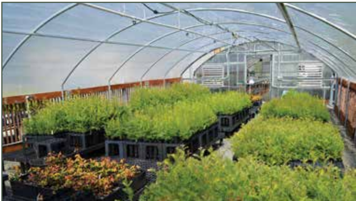
Native plants for Mill Creek and other restoration projects grow in an on-site greenhouse.

RESULTS — By 2015, the restoration team had thinned 4,000 acres of forest, placed 1,000 logs back in streams, and removed 70 miles of crumbling roads with 330 stream crossings. Forests once choked with scrawny Douglas-fir host redwoods, grand fir, and many other native species. Now more salmon are spawning, and the team continues to monitor fish populations, tree growth, and tree spacing and planting options.