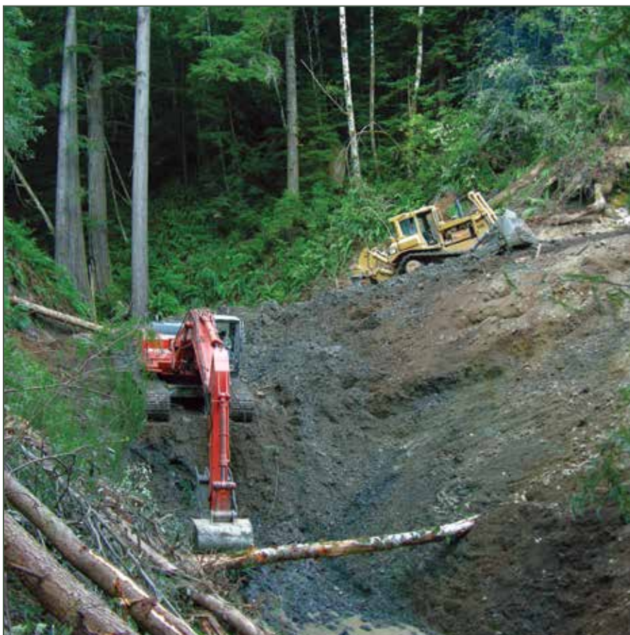
Workers use heavy equipment to remove dirt dumped into a stream in the logging era.

A NEW BEGINNING — California State Parks, with the help of partners, raised $60 million to buy the watershed; they have raised several million more to help restore and repair degraded resources. The partners include Save the Redwoods League, the U.S. Fish and Wildlife Service, California's Coastal Conservancy, the Department of Fish and Wildlife, the Wildlife Conservation Board, and the Smith River Alliance.