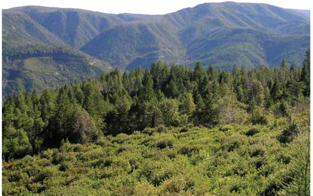
Some of Mill Creek Watershed's old logging roads and clearcuts from the 1980s and '90s.

With the help of scientists, State Parks began experimenting with different treatment options. In “control areas,” they did nothing. In other areas, they cut down Douglas-fir to make room for the redwood and other species, aiming to reduce tree densities to 75 to 250 trees per acre. Where more sunlight could reach the forest floor, young redwoods flourished with less competition, and a more diverse mix of other plants appeared.