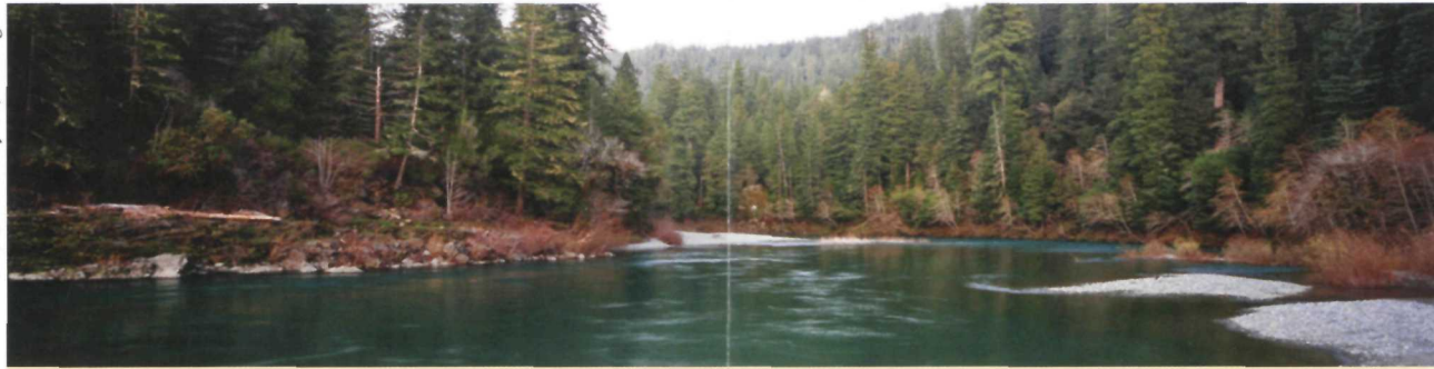
Scenic Smith River, largest undammed river in California

reduced, and the survivors were forced onto reservations. Despite this traumatic history, the Tolowa are a resilient people and have increased their population to more than 1,800 citizens. The Tribe is revitalizing cultural traditions and language, as well as reclaiming their role as stewards of the land.