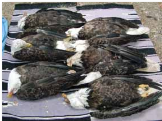
Ingested fragments from spent lead ammunition kill bald eagles and other birds. Using non-lead bullets prevents lead poisoning in wildlife.