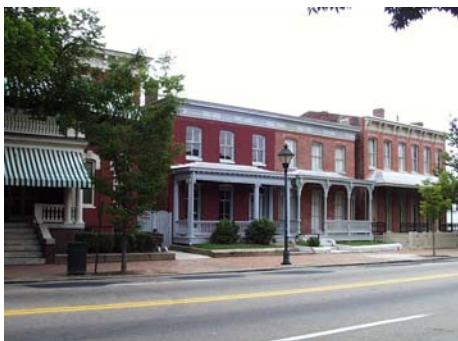
An exhibit in the newly refurbished buildings on Leigh Street will show the history of the St. Luke Penny Savings Bank/ Consolidated Bank and Trust Co., which celebrates 100 years of operation this year.

This summer the National Park Service is proud to reveal the restored facades of the four previously dilapidated buildings. When the buildings were designated part of the federal site in 1978, they had been neglected and altered from their original late nineteenth century appearances. Their utility systems did not meet building codes and few modern conveniences existed. Funds from the demonstration recreation fee program of the Department of the Interior and from the Line-Item-Construction program of the National