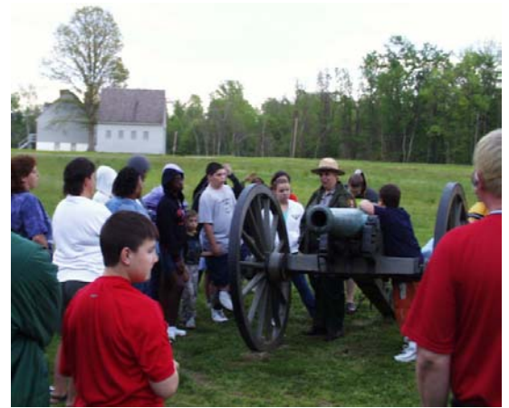
America's Backyard: Exploring Our Public Lands was just one of many programs that contacted a record 20,000 school children this year.

Last but not least, in Making Tracks to Dinosaur National Monument the students and teachers of Seven Pines Elementary School took up Richmond National Battlefield Park's challenge to read (1 book = 1 mile) and run (on the school track) to the equivalent of 4,200 miles, the round-trip distance between Richmond, Virginia and Dinosaur National Monument in Colorado and Utah. For two months students read, ran, and tracked their miles. By using computers in the classrooms students learned about National Parks, Dinosaur National Monument (dinosaurs, history, geology, and