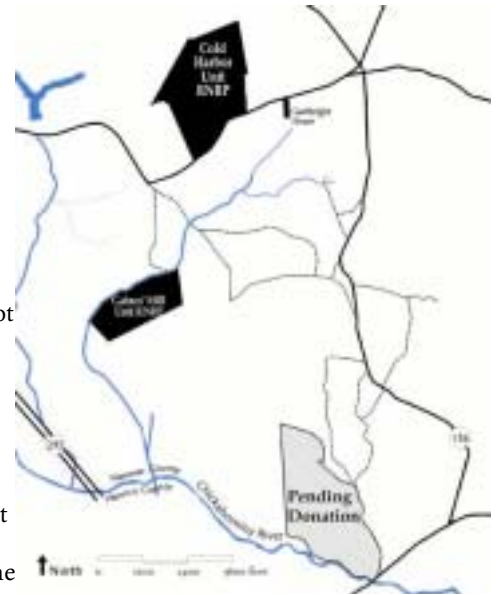
Map showing pending donation in relation to Cold Harbor and Gaines' Mill battlefields.

Fortunately the RC zoning provided opportunities to meet the requirements of the developer, the county and the park. The development is planned creatively to be located outside both the park boundary and the viewshed of visitors as they travel along the park's driving tour route. A series of Confederate rifle pits were preserved by the developer who also proffered sufficient funding to install