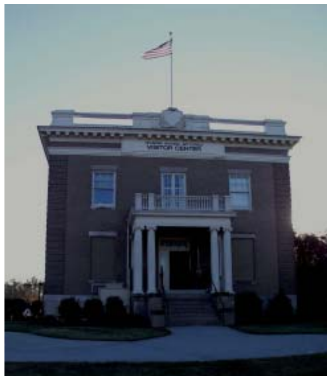
The flag still waves over the Richmond Parks' Headquarters.

There is always more to be done than there is time or money to do it, but I am grateful for the freedom to make choices, the spirit of my colleagues and the American people and the relative abundance that our country sustains.