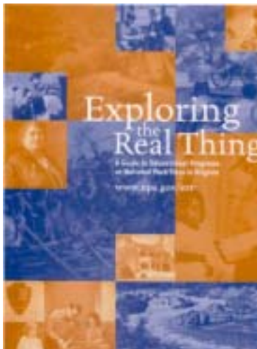
The cover of the new Virginia Teacher's Guide, Exploring the Real Thing .

BY PATRICE FERRELL, EDUCATION COORDINATOR