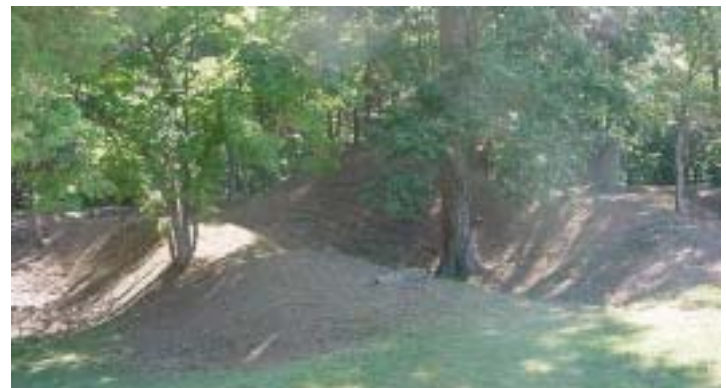
Fort Gilmer after treatment .

For this reason, the park has begun to test a new management technique at Fort