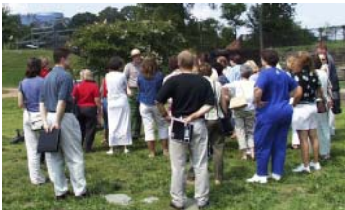
Henrico County 5th grade teachers participate in teachers workshop at Civil War Visitor Center.

As you can see it has been a busy and productive year so far. I can hardly wait to see what the rest of the school year brings!