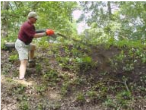
Spraying wood mulch on the walls of Fort Gilmer.

Gilmer, one of several forts in the Fort Harrison unit of the park. In September, the majority of the Fort was covered with double shredded whole wood mulch, three to six