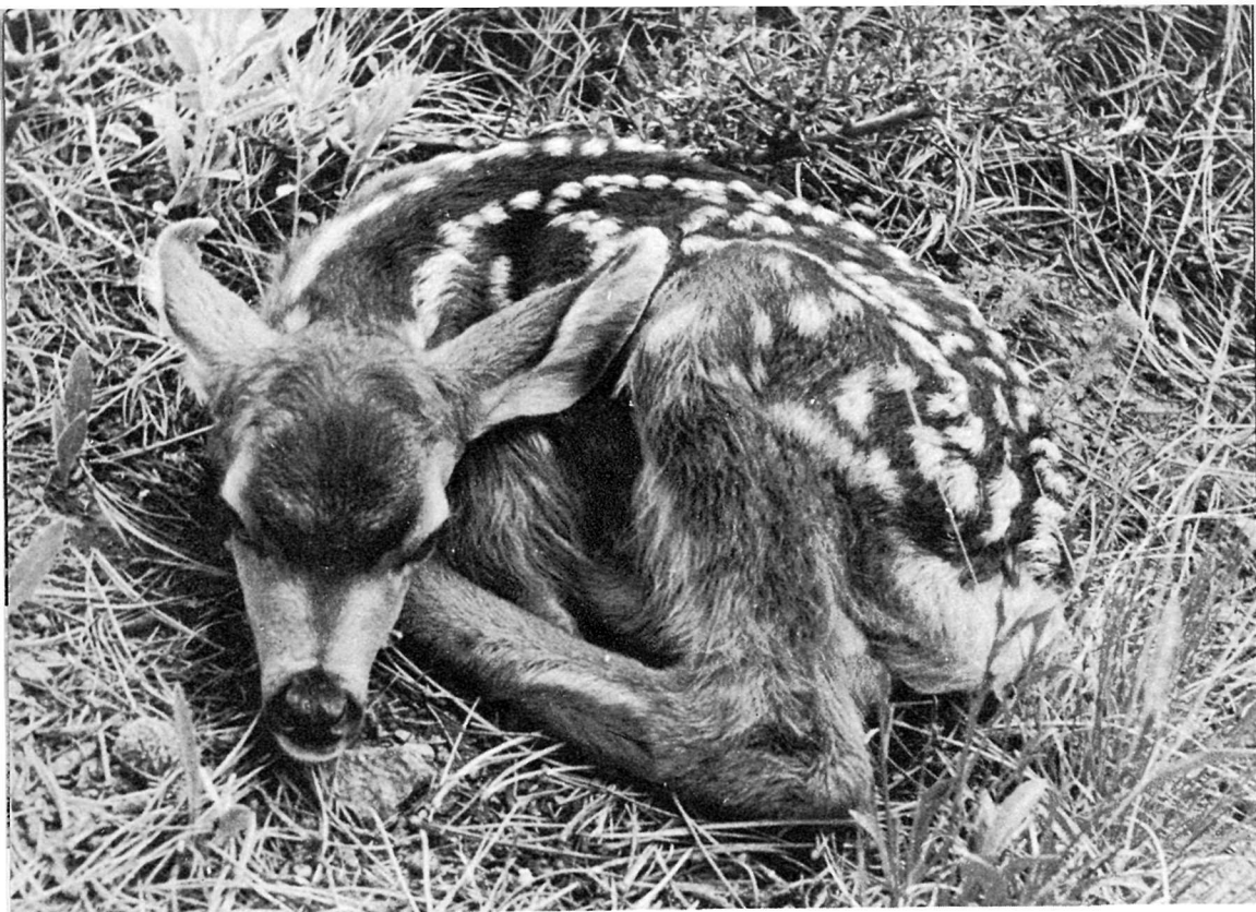
ROCKY MOUNTAIN NATIONAL PARK FAWN.

canyon wrens. The graceful violet-green swallow is abundant, and the crested jay, magpie, and nutcracker are conspicuous for their handsome appearance and vigorous flight. Among the birds possessed of curious and unusual habits are the broadtailed hummingbird, water ouzel, camp robber, nut-hatch, nighthawk, red-shafted flicker, and the ptarmigan. Birds of prey seen during the summer include the golden eagle, red-tailed hawk, sparrow hawk, duck hawk, and Cooper's hawk.