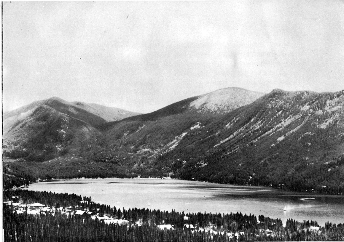
GRAND LAKE—HIGHEST YACHT ANCHORAGE IN THE WEST.

Naturalist services, conducted on regular schedules from early June until mid-September, include field trips of a few hours to a day in length, nature study walks, game stalking parties, auto caravans, moonlight and campfire hikes, daily glacier talks at the Moraine Museum, and other activities. Special