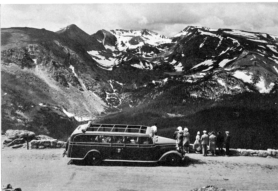
FOREST CANYON FROM LOFTY TRAIL RIDGE ROAD.

A 7.6 mile road from Thompson River Entrance, southwest of Estes Park, leads to Bear Lake, in the center of an amphitheater of peaks between which lie steep-walled gorges dotted with glacial lakes.