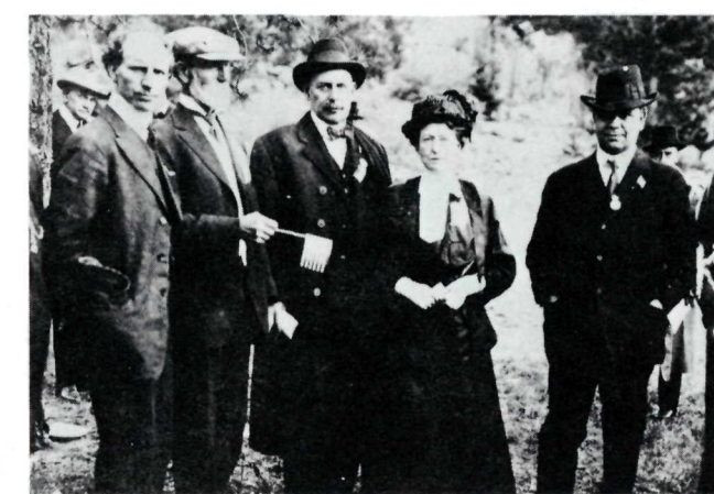
Enos A. Mills (left) served as chairman at the dedication of Rocky Mountain National Park in 1915. Mills, a nationally known writer, lecturer, and naturalist, devoted much of his life to the campaign for the park. With Mills were Rep. Edward T. Taylor (third from left) and Colorado Gov. George A. Carlson (right). Taylor, a skilled politician, shepherded the park bill past its final congressional hurdles.

In the early 1900's, when the automobile began to prove practical as a means of travel, many people urged consideration of a plan to have the area set aside as a national park. The major force behind the idea was one man—Enos Mills, naturalist, writer, conservationist, and philosopher. His years of hard work were rewarded when he participated in the dedication ceremonies for Rocky Mountain National Park on September 4, 1915.