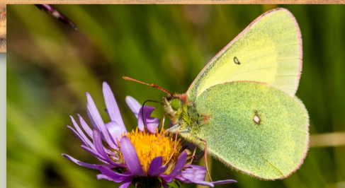
Above: Aspen ( Populus tremuloides) and lodgepole pine ( Pinus contorta). Left: Common sulphur butterfly ( Colias philodice) pollinates a purple aster ( Erigeron simplex).