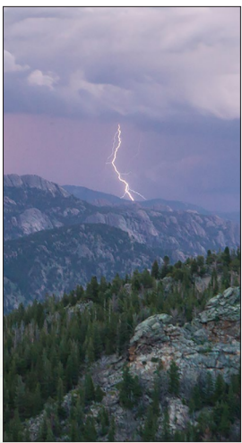
Lightning can kill. Hike early and watch the sky—thunderstorms are more common in the afternoon.

Park Information Check your free park newspaper for current information about visitor centers, safety and highcountry survival, ranger-led programs, services, hiking trails, wildlife, shuttle buses, and more. Find lodging and visitor services at Estes Park and Grand Lake.