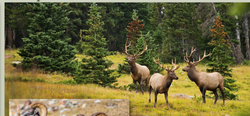
Above: Elk, or wapiti, graze amid Engelmann spruce ( Picea engelmannii). Left: The park is home to over 350 bighorn sheep, which were nearly extinct here in the 1950s.