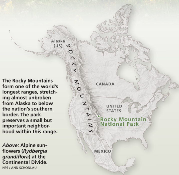
The Rocky Mountains form one of the world's longest ranges, stretching almost unbroken from Alaska to below the nation's southern border. The park preserves a small but important neighborhood within this range.

Thrust skyward by Earth's forces 40 to 70 million years ago, then sculpted by multiple glacial episodes, the Rockies are "new" in geologic terms. In 2009 Rocky Mountain National Park, a small neighborhood within this vast mountain range, became one of the nation's "newest" designated wildernesses. Nature has always ruled this wild, fantastic place. But as human-triggered events outside park boundaries increasingly affect life within the park, how will nature respond? What is our role?