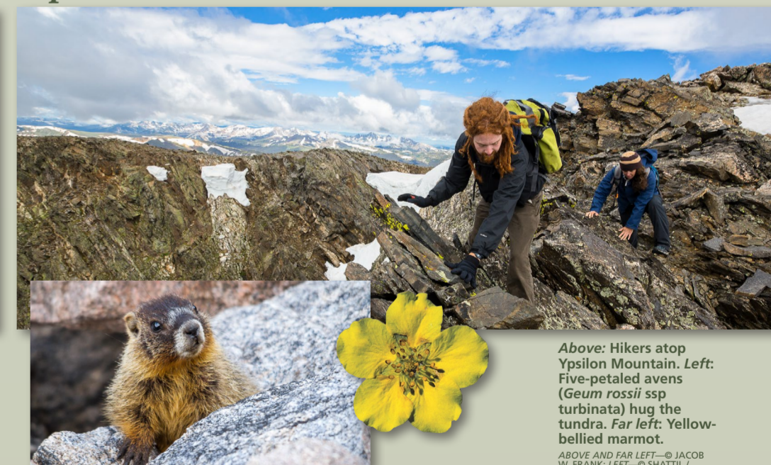
Above: Hikers atop Ypsilon Mountain. Left: Five-petaled avens ( Geum rossii ssp. turbinata) hug the tundra. Far left: Yellow-bellied marmot.