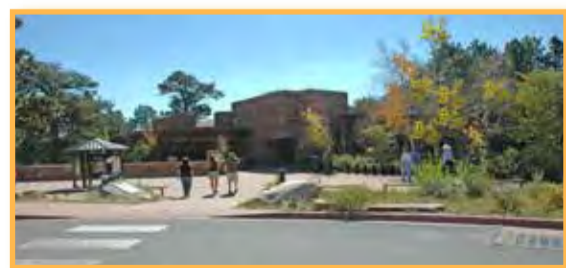
Beaver Meadows Visitor Center