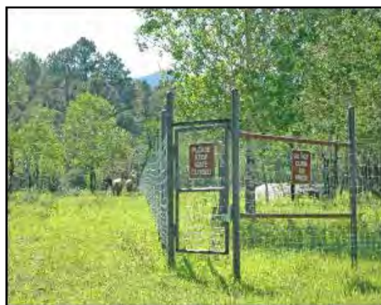
Elk enclosure fence

Each fall since 2008, the park has installed enclosure fences on elk winter range in the Moraine Park, Beaver Meadows, Kawuneeche Valley and Horseshoe Park areas. These enclosures are protecting important riparian willow and aspen habitat from elk browsing.