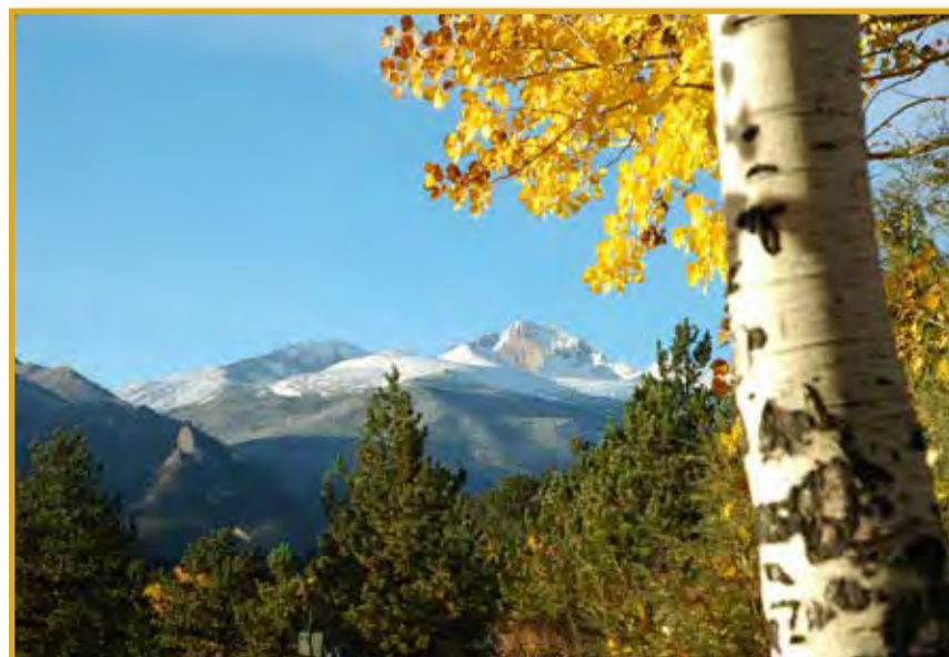
Longs Peak on crisp fall day

Be aware of changing weather, as conditions can deteriorate quickly. Trail Ridge and Old Fall River Road can close temporarily at any time. The park Information Office operates seven days a week and can be reached at (970) 586-1206. For more information see www.twitter.com/RMNPOfficial , or the park website at www.nps.gov and click on road conditions.