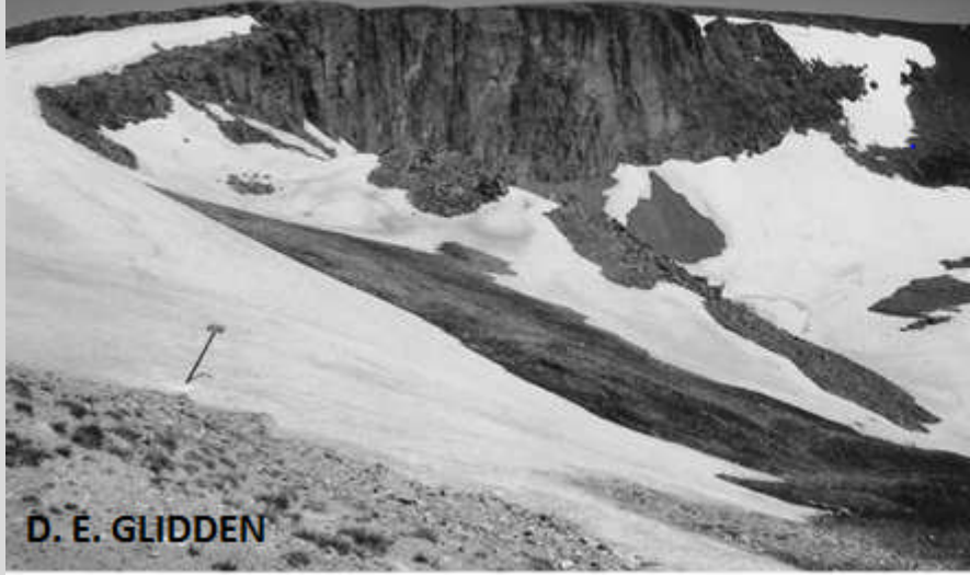
LAVA CLIFFS SNOWBEDS, RMNP, JULY 20, 2005