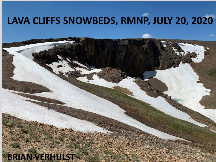
LAVA CLIFFS SNOWBEDS, RMNP, JULY 20, 2020