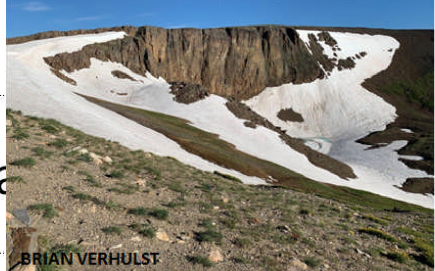
LAVA CLIFFS SNOWBEDS, RMNP, JULY 24, 2019