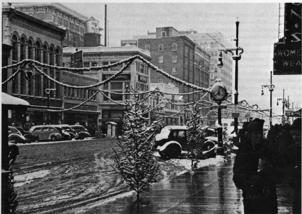
Along with his description of the Christmas season, Carpenter included his own frustrations with shopping for the holidays.

A job of searching for oil which commenced in Ness County last July has been concluded with the drilling of a well and the discovery of a still undetermined amount of the elusive black liquid which greases and turns the wheels of War and Peace. For almost six months we have been in a position to appreciate the changing moods of Western Kansas. Just now there is over everything that barren appearance which must have moved early explorers to include Western Kansas in the Great American Desert. The combines are rusting in the barnyards and the sometimes too chill Autumn winds are like a cool soft hand upon the feverish brow of Summer. Brown is the color which best becomes Western Kansas at this time of year—the earth is brown, the pastures are brown, the trees are brown, and even the man made fence posts, telephone poles, houses and