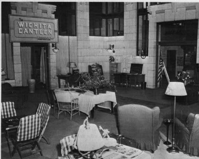
The Wichita Canteen in Union Station, sponsored by the Soroptimist Club, offered military personnel a little "home away from home."

It forcefully reminds us that for the present there is more urgent work to be done.