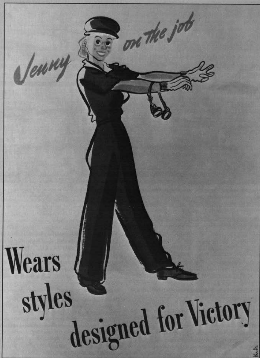
The war had its impact on women's fashions, as Carpenter observed in "A Query Addressed to a Lady in Slacks."