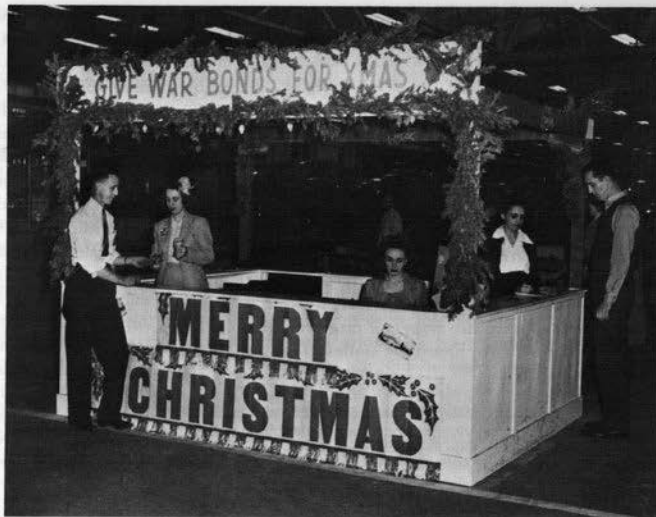
As part of one of the war bond drives this booth was set up in the Beech plant.