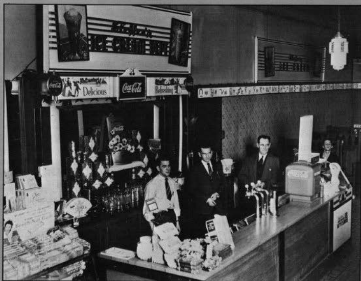
For Carpenter a surprising change at Wichita restaurants, cafes, and soda fountains was the lack of menu choices and service.