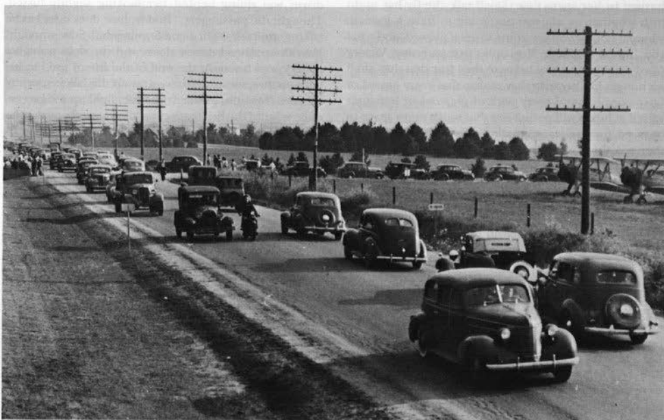
Carpenter reported many times on the traffic and changes to Wichita streets. Shown here is South Oliver Street (looking north) during the morning hour change of shift at Boeing. Boeing Kaydets, used for flight training, can be seen near the plant entrance.

A few days ago shoes were placed on the ration list. The allowance is fair and entirely adequate for all normal needs. All canned goods and many other foods are to be rationed March 1st. We are constantly coming into contact with priorities and voluntary rationing. One no longer goes into a store to be sold something by a clever salesman. In order to get anything one must be a clever buyer armed with the proper credentials. The proper approach is, "Please, Madam, what priority rating must I have in order to buy this ruling pen?" The correct answer to that is, "Listen Squirt, before you can even inquire about draughting materials you must have a priority rating of quadruple A, five triple B, four double Y, three Z one." Remember how you used to buy a couple of candy bars, one for you and one for the girl friend? A few nights ago at Stafford, a complete canvass of the town revealed not a single candy bar. At Dockum's the other day a few candy bars were offered for sale and a man daring to ask for two was accused of sabotage by the zealous girl at the cigar counter.