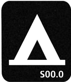
Designated campsite sign

Specific camping regulations are in effect for the St. Croix River between St. Croix Falls, Wisconsin - Taylors Falls, Minnesota, and the Soo Line High Bridge. Visitors who plan to camp overnight in this stretch of river must have a free National Park Service annual camping permit. The permit application is available online at: www.nps.gov/sacn . Campers can obtain the permit at the St. Croix River Visitor Center. Additional details of the regulations are contained in this publication.