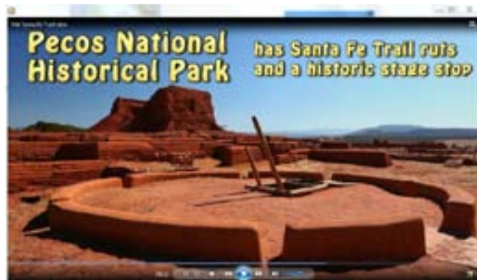
Opening scene for one of the 30-second videos under development.

NTIR is working with the staff at Petroglyph National Monument in New Mexico to produce a series of 30-second videos, one of which will be about the Santa Fe Trail. For this project, videos of National Park Service sites and trails in New Mexico will be presented on an interactive 3 x 4 foot table top touch screen (similar to an iPad).