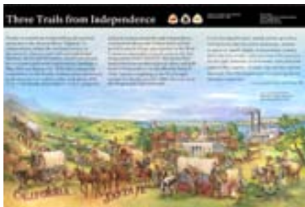
McCoy Park, Independence, Missouri The exhibits were unveiled during the Oregon-California Trail Association conference in Lawrence, Kansas, in August.