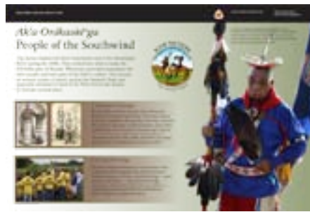
Kaw Nation Exhibits, Kansas The exhibits show how the Nation struggled with westward expansion – losing homelands and lifeways.