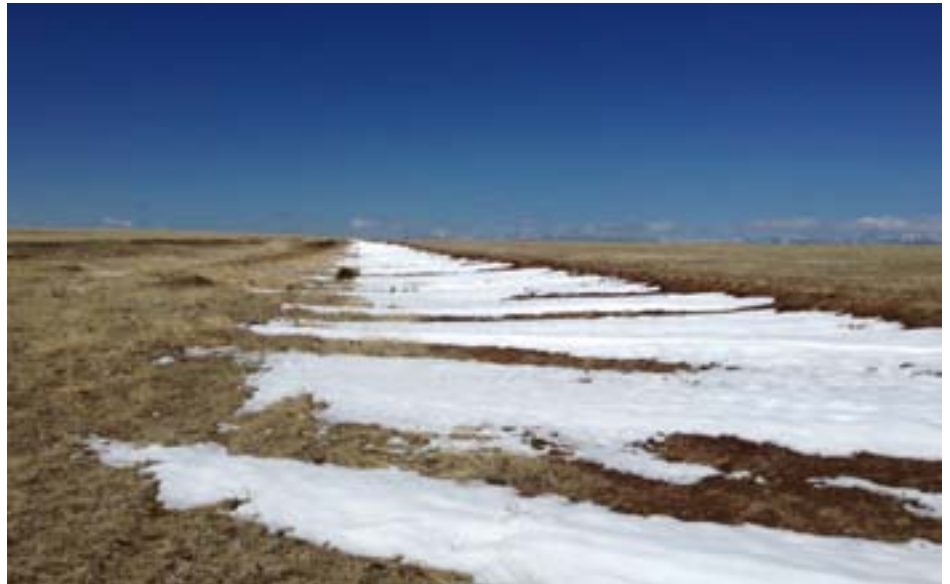
An example of a Santa Fe Trail segment north of Tiptonville, New Mexico, that is being nominated to the National Register.

KANSAS: Through an agreement with the Kansas State Historical Society (KSHS), the existing 1993 Multiple Property Documentation Form (which is a "master document" under which Santa Fe Trail properties can be nominated) has been amended to reflect up-to-date trail research. In addition, NPS, KSHS, and SFTA reviewed a list of potential properties, most of which contained extant trail ruts. Twenty-six sites were carefully chosen, each of which have property owners that support trail preservation.