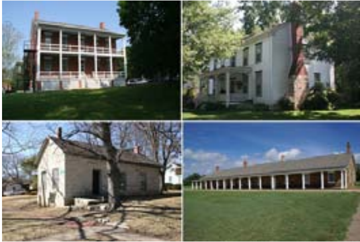
Buildings included in the study in Kansas.

Clockwise from upper left: Building 100 (Fort Leavenworth); Rogers House (Overland Park) Infantry Barracks (Fort Larned); Last Chance Store (Council Grove)