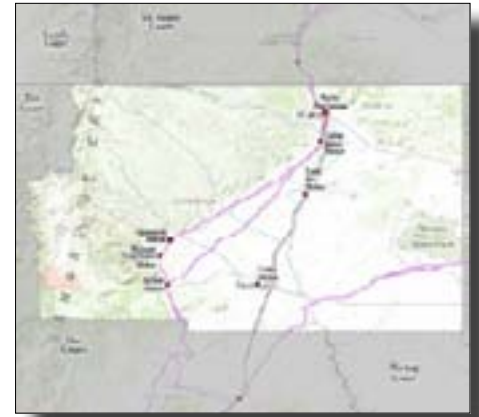
DAR markers map

A volunteer from the University of New Mexico is working with NTIR and SFTA to create a two-map series that locates Daughters of the American Revolution (DAR) markers along the trail. All markers except those in Colorado were mapped.