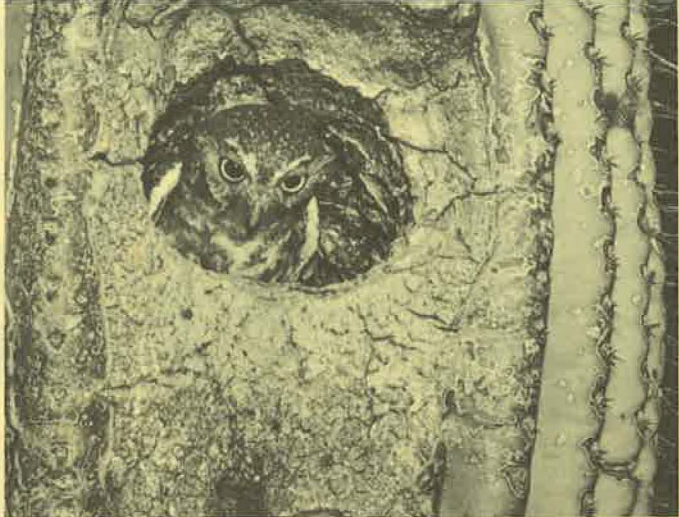
A tiny elf owl occupies an abandoned woodpecker nesting hole in a saguaro stem.