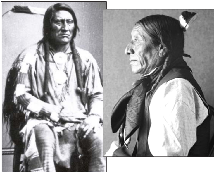
L-R: Chief Lean Bear; Chief Whirlwind, a Sand Creek survivor who later led his people to a reservation in Indian Territory.

In August, the War Department authorized Territorial Governor John Evans to raise a new volunteer regiment, the Third Colorado, for service against the Indians. Over a thousand men responded to the call for recruits. A September meeting between Arapaho and Cheyenne chiefs, Governor Evans, and Colonel John Chivington accomplished little. The Cheyenne and Arapaho were directed to make their way toward Fort Lyon near the reservation, while Colonel Chivington made plans for a winter campaign on the Colorado plains.