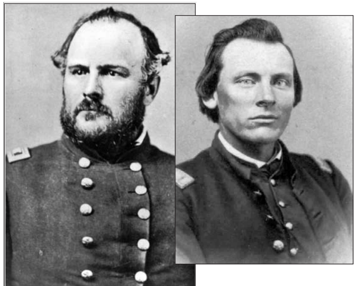
L-R: Ordained minister Colonel John Chivington, commanded the troops at Sand Creek; Colonel George Shoup, commanded the Third Regiment, and later became Idaho’s first Governor.

Thank you for your interest in Sand Creek Massacre National Historic Site!