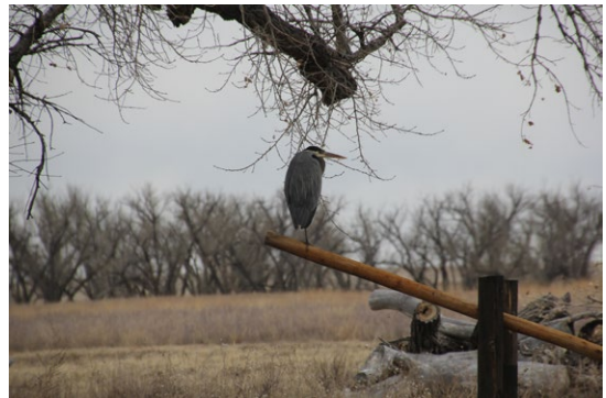
Great Blue Heron in the visitor use area

The best place to observe birds in the park is the visitor use area, where riparian species such as Red-headed Woodpecker, Northern Flicker, and Yellow Warbler are found in the cottonwood trees. Grassland and shrubland bird species like Western Meadowlark, Horned Lark, Burrowing Owl, Northern Harrier, and Dickcissel may sometimes be seen along the Monument Hill and Bluff Trails.