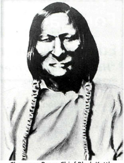
eyenne Peace Chief Black Drawing courtesy History Colorado

In October 1865, Wynkoop escorted peace commissioners to a meeting with Cheyenne and Arapaho on the Little Arkansas River. The resulting Treaty of the Little Arkansas condemned the Sand Creek massacre, promised compensation to victims' families, but it also required the