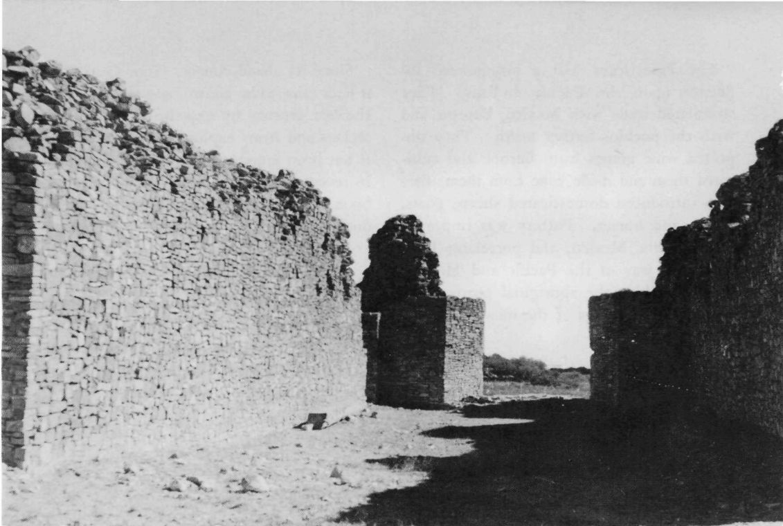
The nave of San Buenaventura after more than two centuries and a half of abandonment.