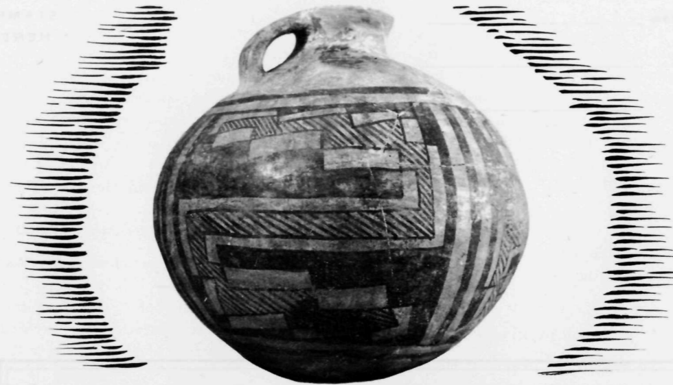
Chupadera black-on-white pottery once used by Pueblo Indians in the town near the mission.

In addition to Pueblo Indian remains, there are traces of another group. These people were the Apache, a nomadic people who alternately traded with and attacked the