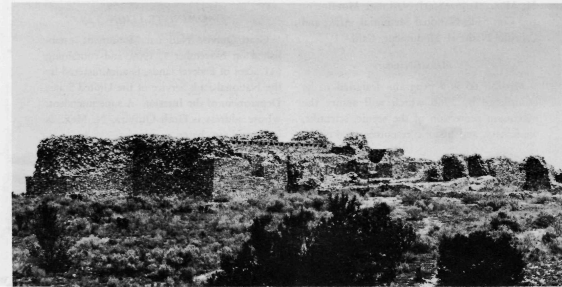
San Buenaventura mission ruins crown the hilltop.

The National Park System, of which this area is a unit, is dedicated to conserving the scenic, scientific, and historic heritage of the United States for the benefit and enjoyment of its people.