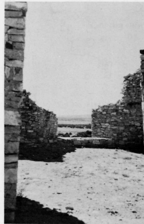
Sacristy door and window from the chapel of the larger mission.

sedentary Indians. The Apaches are the only aboriginal people still in the region; they live on the Mescalero Reservation, 50 miles distant.