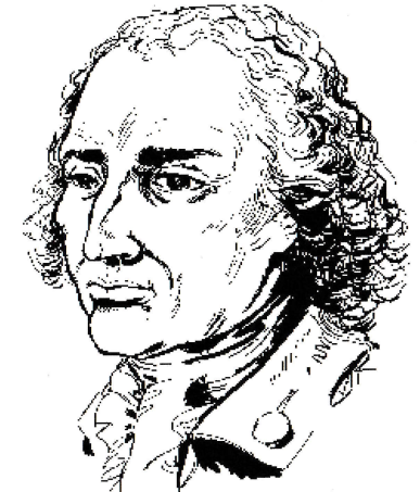
Philip Schuyler, as an older man.