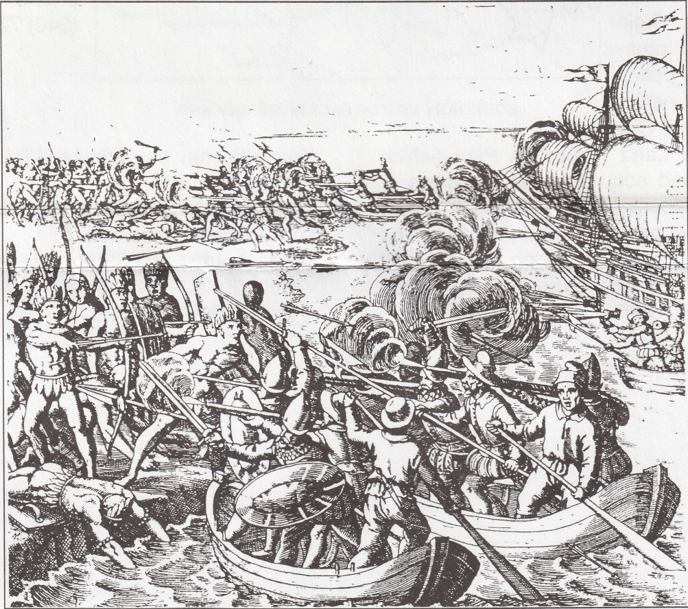
CARIBS BATTLE SPANIARDS, DOMINICA, 1494.