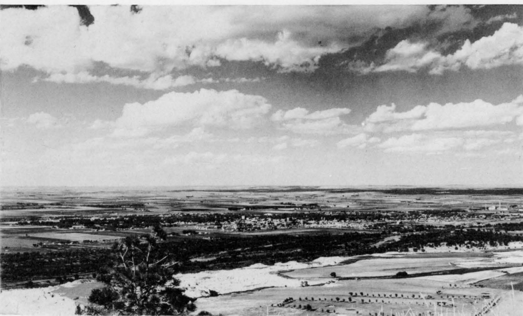
View from summit, looking toward city of Scotts Bluff.

Except for intermittent stretches of cultivation, or where modern roads have been superimposed, the trough of the old Trail, ground down by the passage of a quarter of a million emigrants, can still be traced across the continent. At Scotts Bluff it can be seen from the trans-monument highway south of the east entrance, across from the headquarters area, and through Mitchell Pass. Here are a marker and a parking area, from which point one can walk