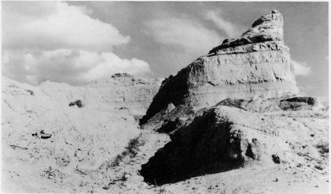
Oregon Trail trough near Mitchell Pass, looking east.

In order to avoid the obstacles imposed by